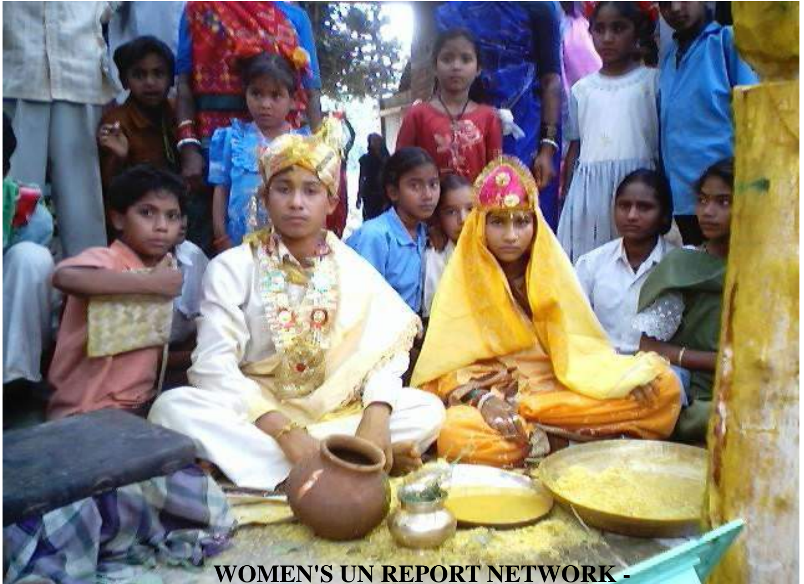
WOMEN'S UN REPORT NETWORK - WUNRN